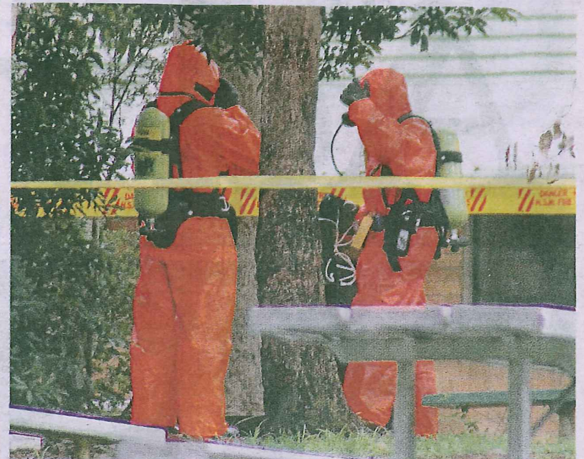
HAZARDOUS: Firefighters at the scene of the emergency at Woolgoolga High School yesterday.