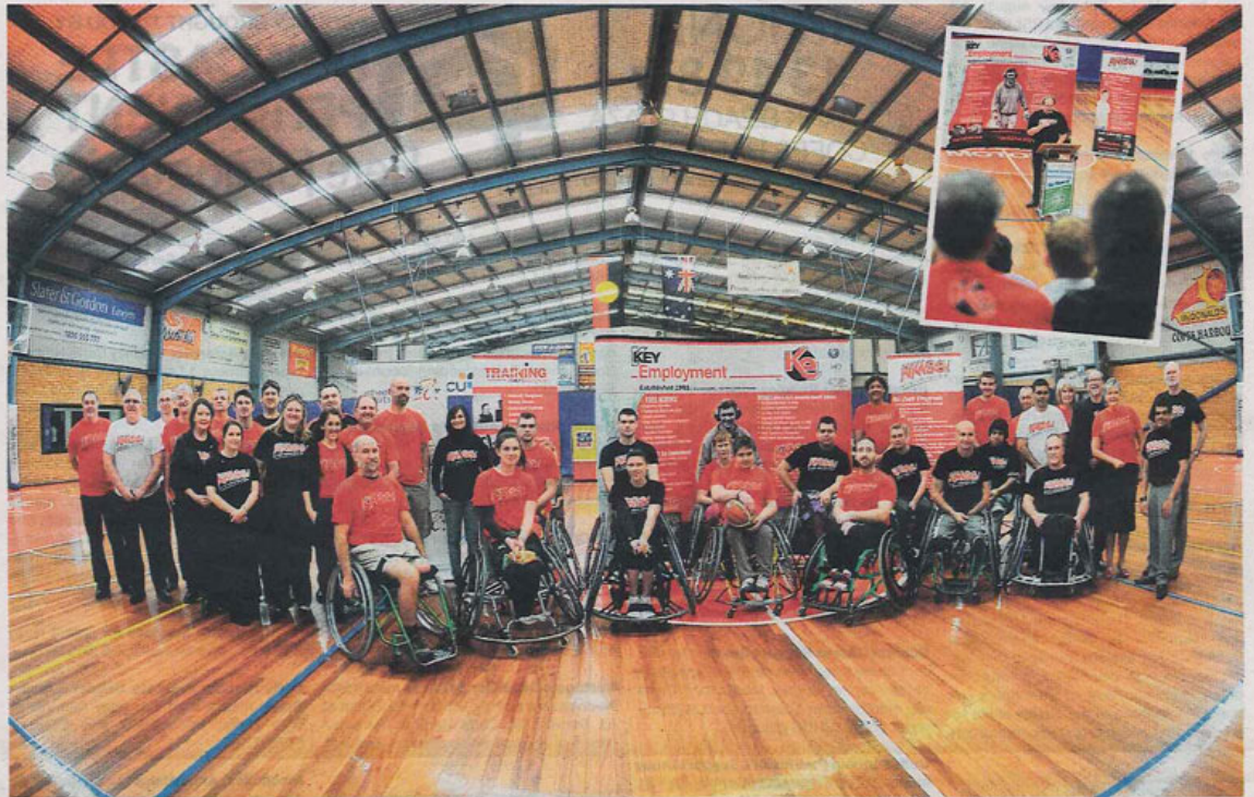
NEW SPONSORS: The Key Employment team stand behind the players they now sponsor – the regional wheelchair basketball team – at the 20th anniversary celebration at SportzCentral.

"At the end of the day, we believe in the talents and abilities of our